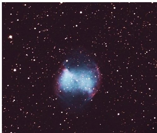
M27 (Dumbbell) Planetary Nebula.